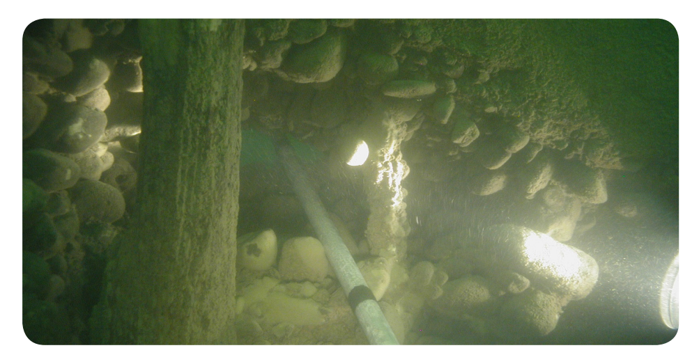
Pictured above and to right: Underwater inspections of bridge piers show deterioration, evident in concrete voids, anchorage system corrosion, scour at the mudline and scaling at the waterline.