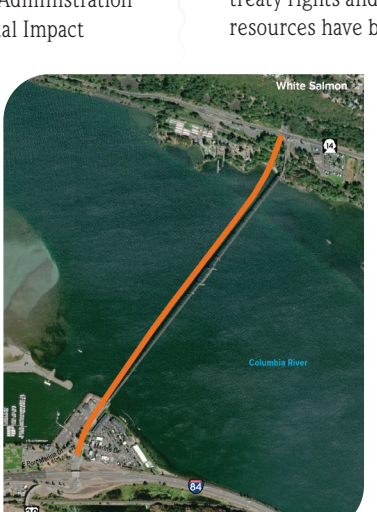
Alternative EC-2 is the preferred alignment agreed upon by the Bi-State EIS Working Group.

After publishing the Supplemental Draft EIS last November, the Port hosted a public comment period from November 20, 2020 – January 4, 2021, including a virtual Public Hearing to hear verbal comments. Comments were submitted online, by email, phone and in writing. Over 150 comments were received and will be responded to in the combined Final EIS / Record of Decision (ROD).