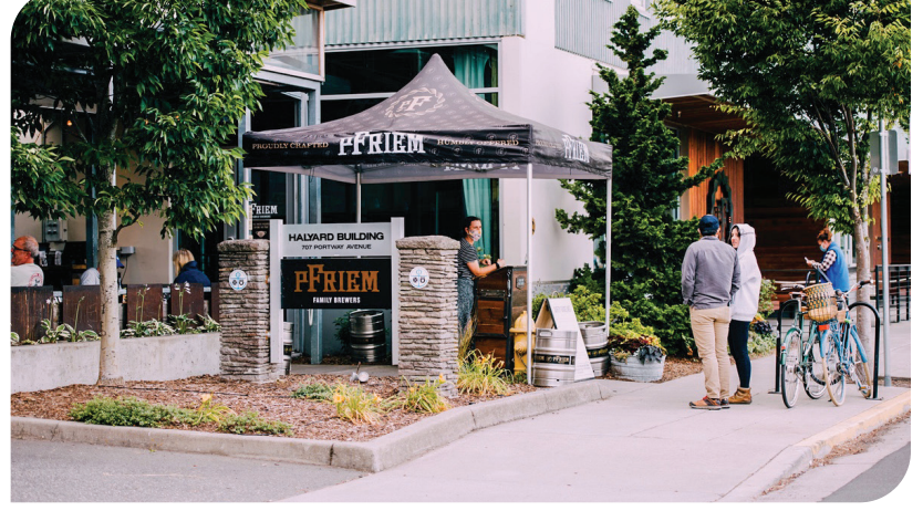
pFriem Family Brewers continues to implement operationl changes in response to COVID-19.

As a hospitality and tourism-oriented business, pFriem Family Brewers saw large revenue declines as a result of pandemic dining restrictions. The company's wholesale business, which relies on purchases of kegs by bars and restaurants, was also impacted.