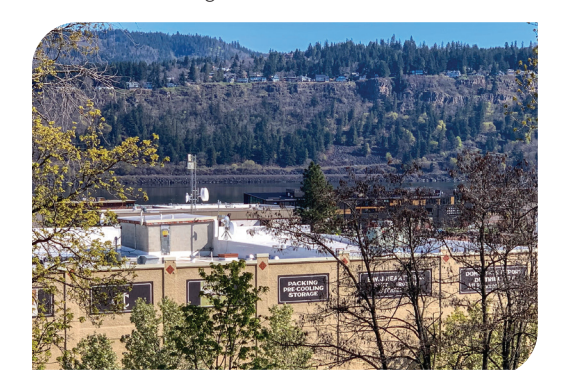
Big 7 building's re-roof.

The Port's Big 7 Building, part of the original Fruit Cannery Complex redeveloped in the late 1980s/early 1990s, recently benefited from a re-roof project that included complete roof removal down to the structural deck and installation of a new PVC thermoplastic membrane roof. Work was completed by Competitive Commercial Roofing in late 2020.