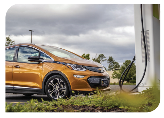
A charging station for Forth's electric car sharing program will be located at the waterfront.