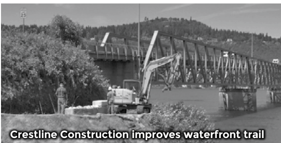
Crestline Construction improves waterfront trail

■ An Intergovernmental Agreement (IGA) and five-year lease with Hood River Valley Parks and Recreation District was executed for a dog park on Port and City property on the west end of Portway Avenue.