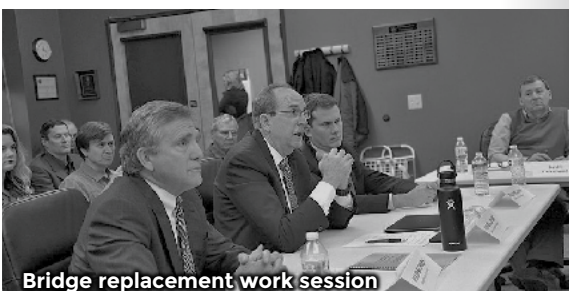
Bridge replacement work session