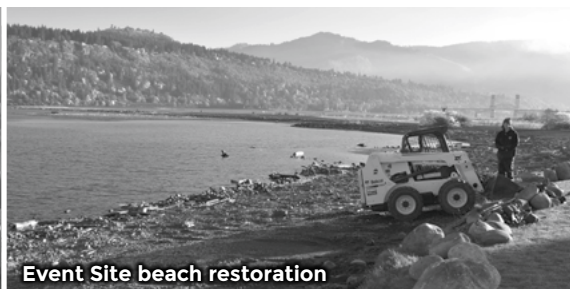
Event Site beach restoration