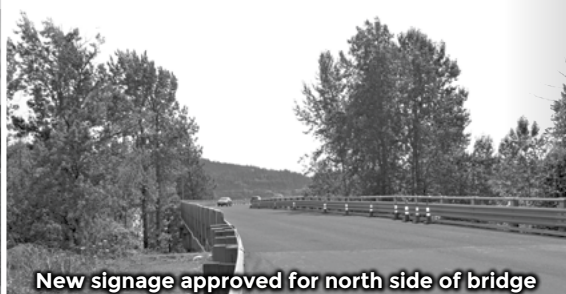
New signage approved for north side of bridge