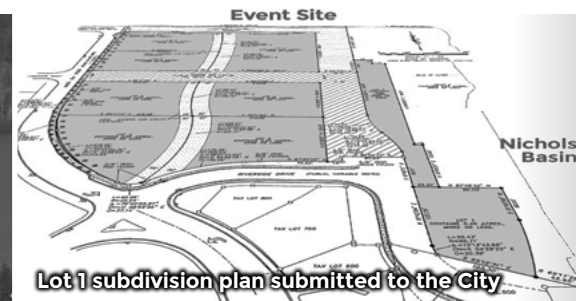
Lot 1 subdivision plan submitted to the City