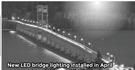
New LED bridge lighting installed in April