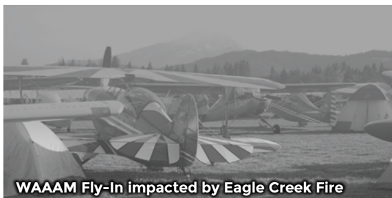
WAAAM Fly-In impacted by Eagle Creek Fire

■ As a support agency, the Port dedicated staff time, contributions and resources toward the Eagle Creek Fire emergency response. Tolls were waived for five days during evacuations at Cascade Locks and significant emergency response.