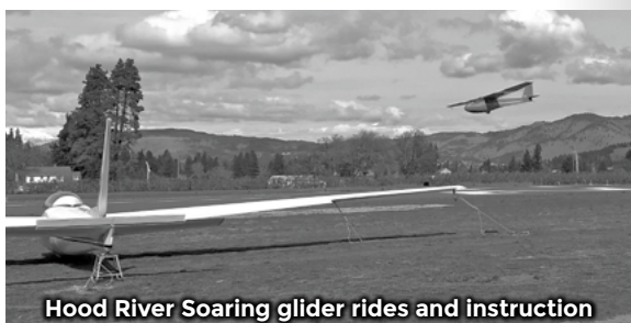
Hood River Soaring glider rides and instruction