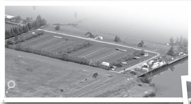
New parking plan approved for Event Site area