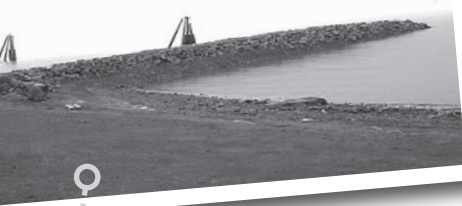
Jetty and beach repairs completed at Event Site

■ The Port approved a contract with Richard Brown Architects for tenant improvements for a potential tenant for the Halyard Building.