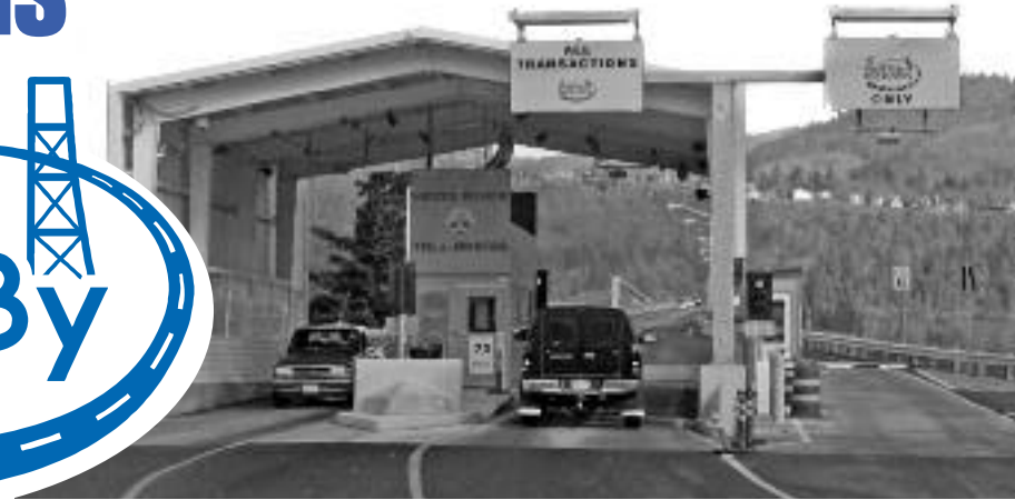
The Port of Hood River opened its Electronic Toll Collection system, BreezeBy, in mid-November.