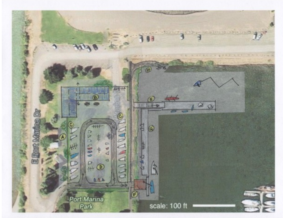
COMMUNITY BOATING CENTER November 2015

sense as the location is zoned recreational/open space (versus the commercial zoning by the DMV Building), the waters in the north corner of the basin are calm and protected, and parking is available along the Marina beach. The Community Boating Center, which could be a phased project, would include a fenced area with covered and open storage for canoes, dinghies and small craft (on trailers or on racks), and a covered breezeway connection to a building for classroom/event space with a second floor that could be leased. Having someone on site at the Center would be an ultimate goal (or under Port lease?). A hoist is also envisioned, along with a ramp to docks in the basin or possibly a natural ramp on the Marina Beach for water access. Modular docks, which have a longer life and more easily moved, were mentioned, with possibly the Port purchasing the docks and then leasing out. It was noted a minimum ramp width of 10-12 feet would be needed for dolly or hand-carried watercraft launching. Revenue assumptions on the numbers of stored watercraft and hoist use ranged from a conservative $30,000 to $75,000 annually. A Center would also draw interest with regattas, bringing more revenue into the community with lodging and meals. Along with this discussion, the comment regarding the need to deepen the existing boat launch ramp should be considered.